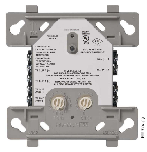
FMM-1(A) (Type H)

Use to monitor a zone of four-wire smoke detectors, manual fire alarm pull stations, waterflow devices, or other normallyopen dry-contact alarm activation devices. May also be used to monitor normally-open supervisory devices with special supervisory indication at the control panel. Monitored circuit may be wired as an NFPA Style B (Class B) or Style D (Class