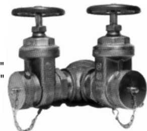
Figure No. 5250

Figure No. 5250 4 X 2 1/2" X 2 1/2" 5260 6 X 2 1/2" X 2 1/2"