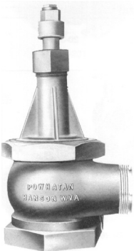
Figure No. 5235-5245

For Use as a Fire Dept Outlet Connection. Designed to Prevent Unauthorized Use.