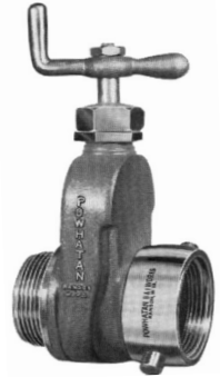
Figure No. 5155

STANDARD EQUIPMENT: solid top, brass body, painted red with polished brass trim, swivel inlet with pin lug. 2 1/2" size only.