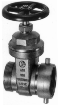
Figure No. 5150

STANDARD EQUIPMENT: brass body with brass trim, swivel inlet with pin lug. 2 1/2" size only. Red hand wheel.