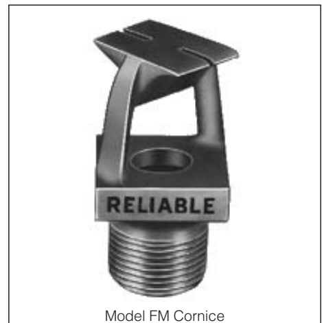
Model FM Cornice

For specific water distribution information, refer to the spray distribution section of the catalog.