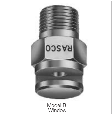
Model B Window