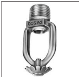
Model G Standard Conventional

This deflector configuration is used primarily in those countries where the LPC installation rules have precedence. The sprinkler distributes approximately 60% of its water discharge upward against the ceiling with the balance downward. It may be installed in either the upright or pendent position. Sprinklers with conventional deflectors are available with orifice sizes corresponding to light, ordinary and extra-hazard installations. See Technical Bulletins 110 and 117.