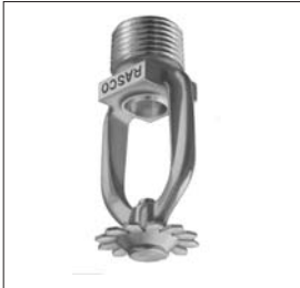
Model G Standard Pendent