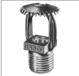
Model F1 Standard Upright

Models G and F1 standard upright and pendent sprinklers distribute water laterally and downward in a wide pattern approximating a half sphere. This hemisphere is completely and uniformly filled with water in the form of small drops and spray. A circular area, from 12 to about 20 ft. (3.7 to 6.1m) in diameter, is covered 10 ft. (3.0m) below the sprinkler at minimum water discharge pressure. See Technical Bulletins 110 and 117.