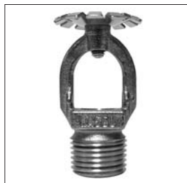
Model F1 Standard Conventional