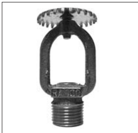
Model G Standard Upright