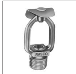
Model G Vertical Sidewall