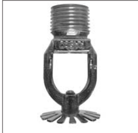
Model F1 Standard Pendent