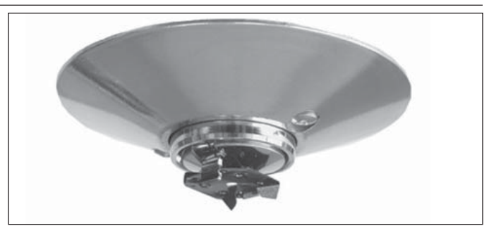
Model XL INST Pendent

Modern architectural designs require sprinklers that provide not only the best fire protection, but also an attractive appearance. The Model XL INST meets both criteria. The flush style of this sprinkler provides for an aesthetically pleasing installation by concealing the entire sprinkler's operating parts with the exception of the heat sensing link.