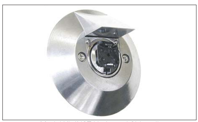
Model XL INST Horizontal Sidewall

The Model XL INST has been designed for use in correctional and mental health facilities and in any other type of institution where attempts by an occupant at self-injury might involve the use of a fire sprinkler. The heat sensor is designed to release a suspended load that exceeds 50 lbs. when dropped from a 1-inch height. The conical escutcheon assembly is firmly attached to the sprinkler body with tamper resistant fasteners. The horizontal sidewall model uses an escutcheon with an integral deflector shelf.