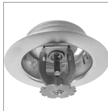
Recessed Extended Coverage Pendent FP