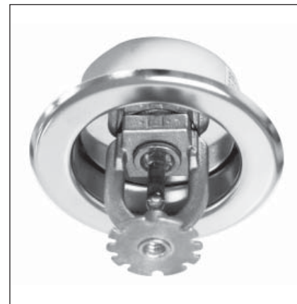
Recessed Extended Coverage Pendent F1/F2