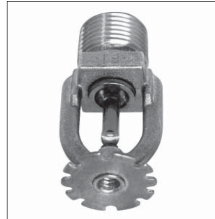
Extended Coverage Pendent

The most common applications for Model F156-300 EC Pendent and Recessed EC Pendent Sprinklers will be in fire protection systems for high rise buildings or where the pressure entering the sprinkler system is in excess of 175 psi (12 bar). The use of these sprinklers will provide an opportunity to reduce or eliminate the need for pressure reducing valves.